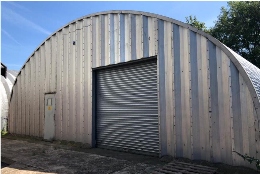
Rear Yard - External Workshop / Store