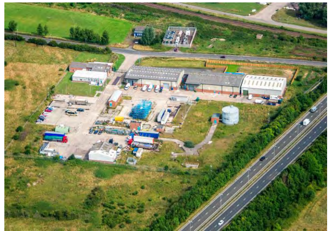
Particulars & Image Aug 2018

Please contact this office for a convenient appointment to view or for further information.