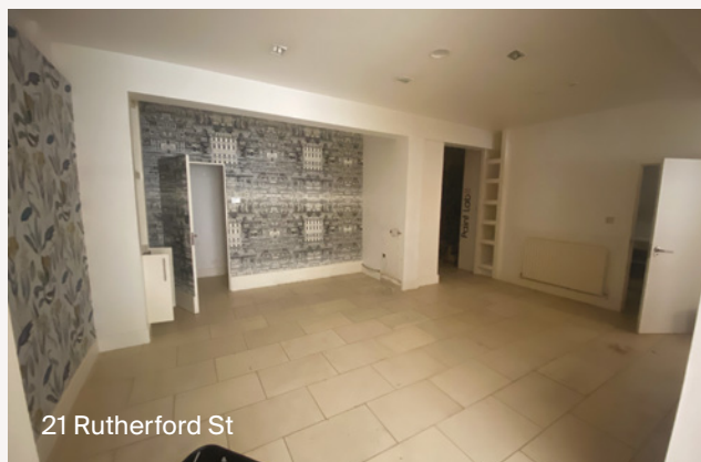
21 Rutherford St