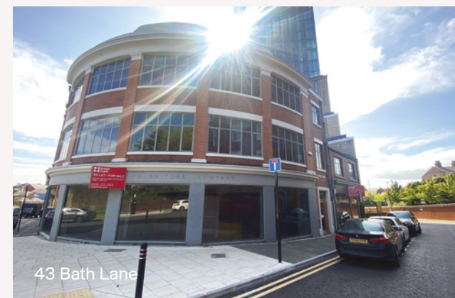
43 Bath Lane