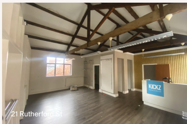
21 Rutherford St