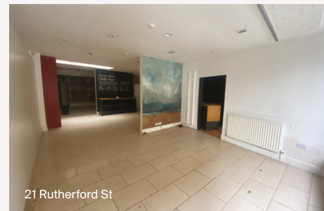
21 Rutherford St