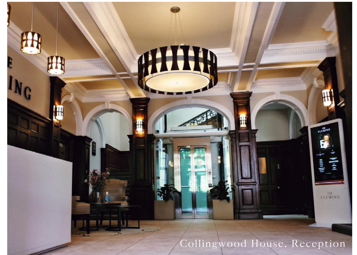
Collingwood House, Reception