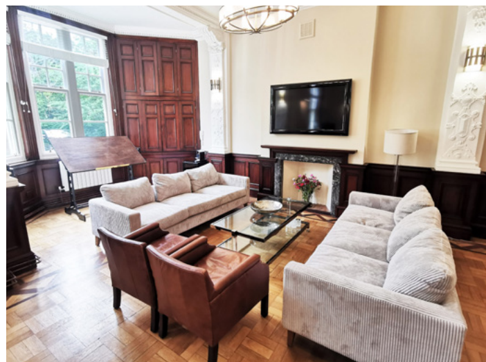
RIGHT Tweed Room