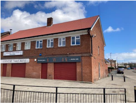
Particulars: April 2021