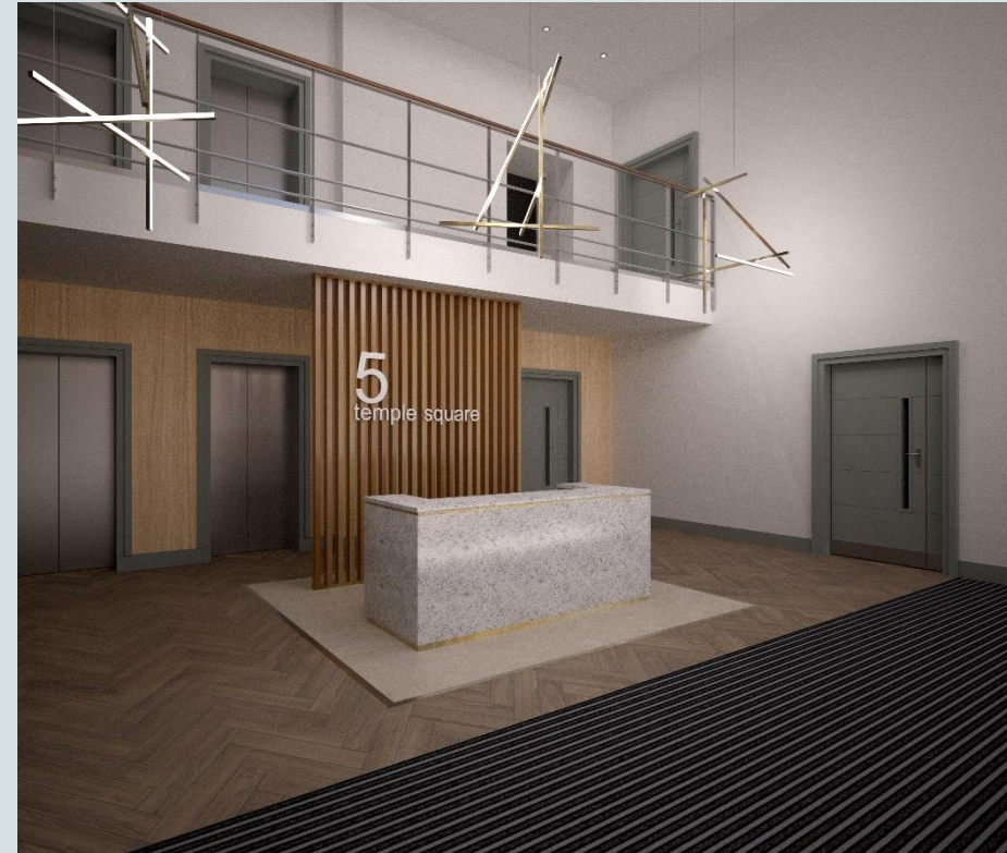
CGI of proposed reception