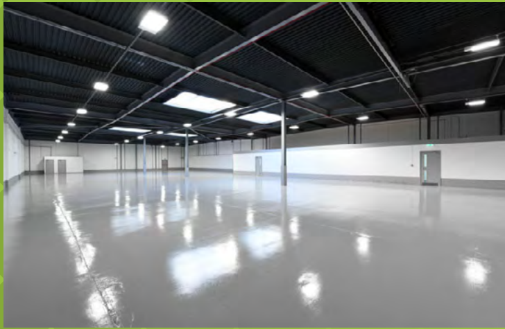
Unit under refurbishment - Image for illustrative purposes only