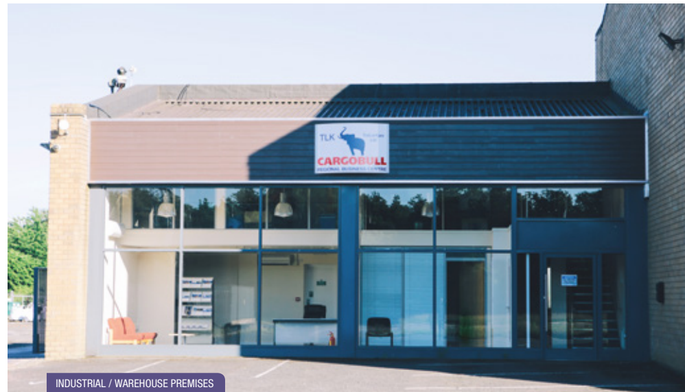
INDUSTRIAL / WAREHOUSE PREMISES