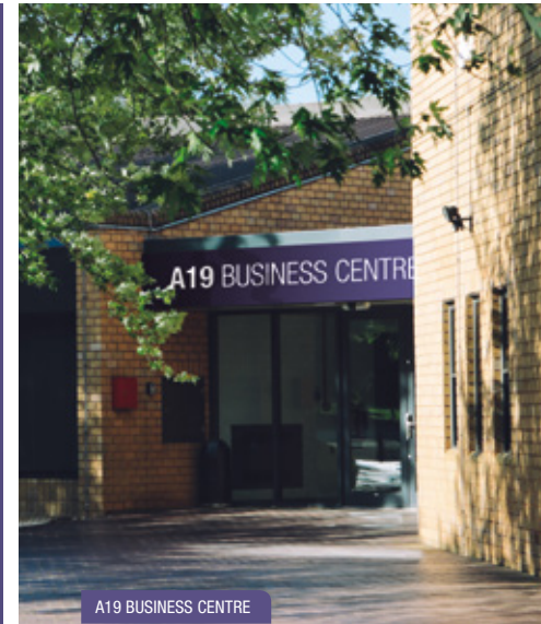
A19 BUSINESS CENTRE