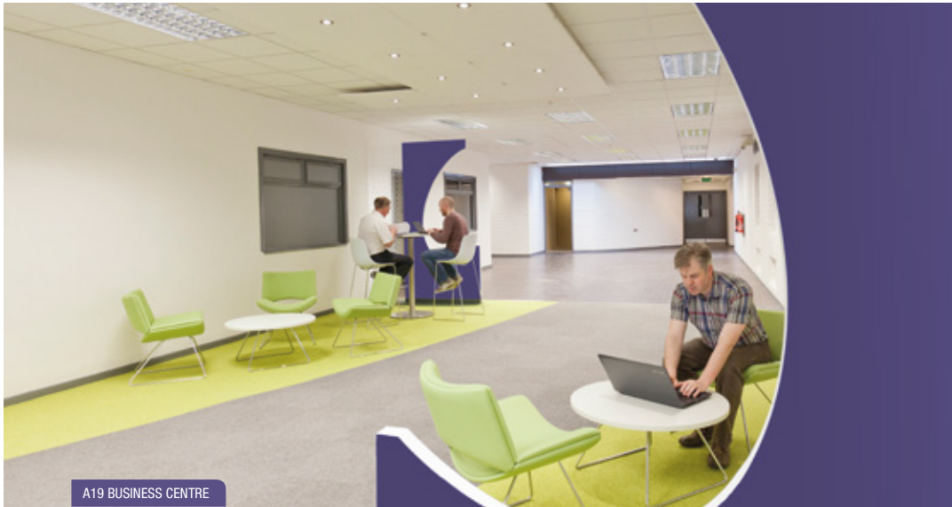
A19 BUSINESS CENTRE