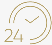
24 HOUR ACCESS