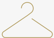
GET READY ROOM