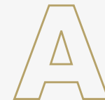
TARGETING EPC A