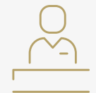
CONCIERGE WITHIN WAREHOUSE BUILDING