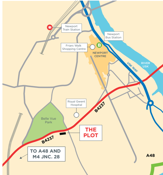
Plans are for identification only. Not drawn to scale

The site benefits from good public transport links to include a bus stop directly outside the site which operates a regular service. Newport Train Station is approximately 1.5 miles to the south.