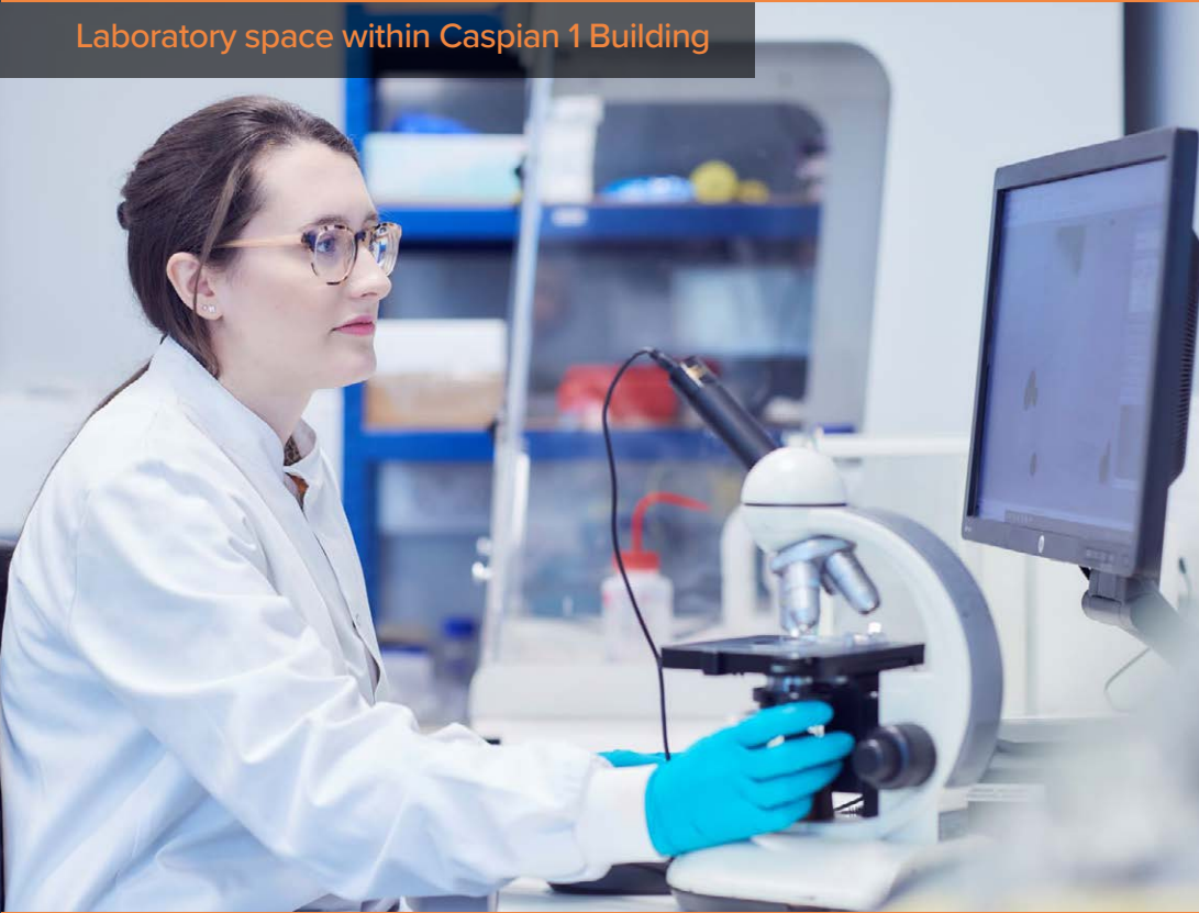
Laboratory space within Caspian 1 Building