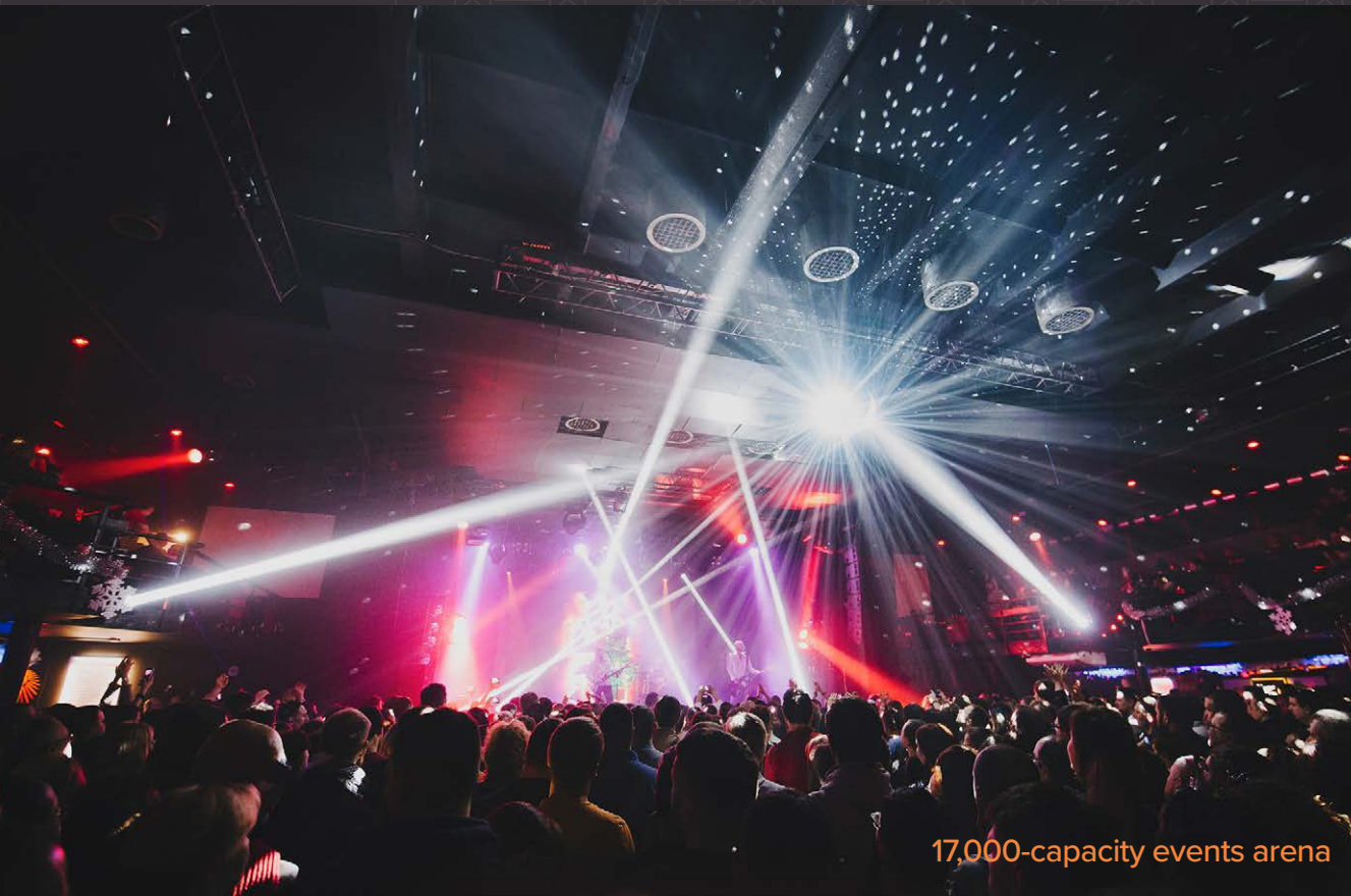
17,000-capacity events arena

A modern, mixed-use development includes food and leisure amenities.