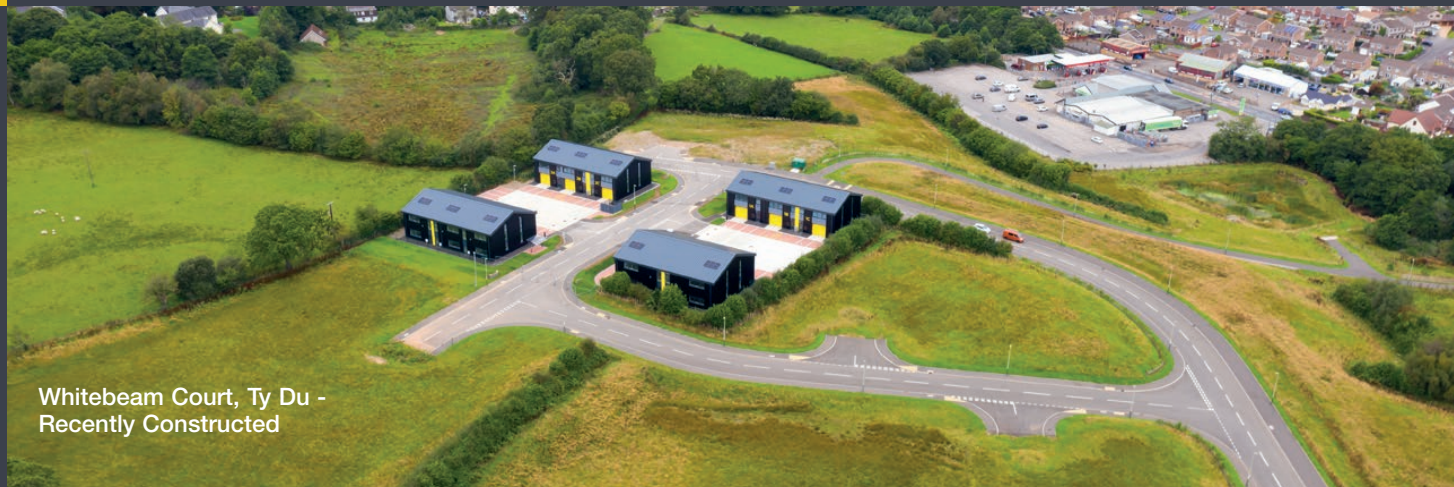
Whitebeam Court, Ty Du - Recently Constructed

Full information on services, topographical surveys, ground investigations, site investigations are available upon request.