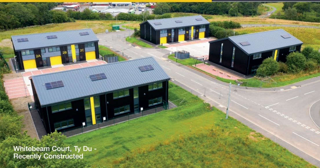
Whitebeam Court, Ty Du - Recently Constructed