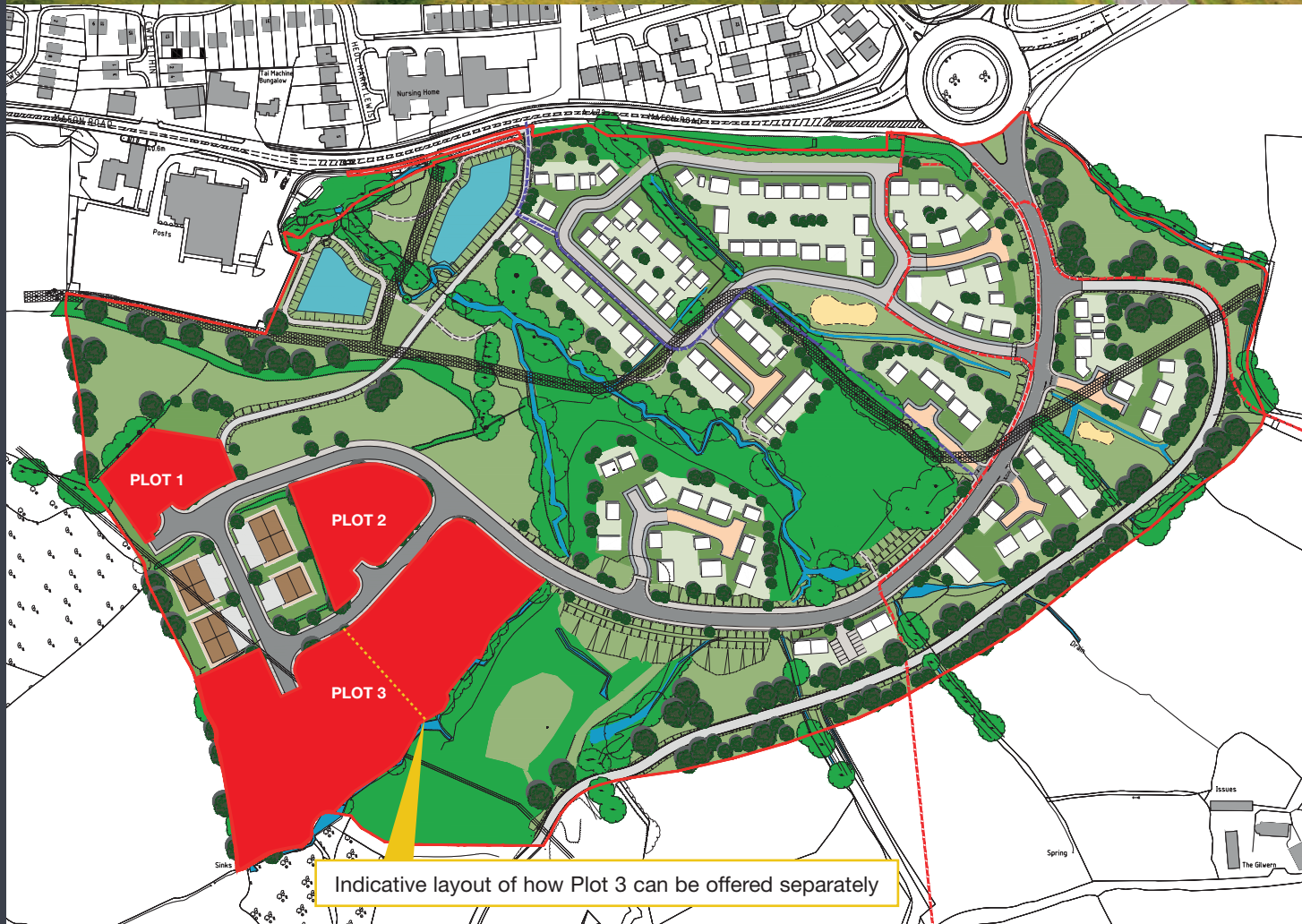
Indicative layout of how Plot 3 can be offered separately