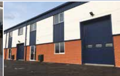
Indicative photos of similar scheme