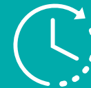
24 Hour Access