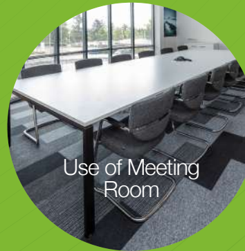
Use of Meeting Room