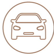
1:229 sq ft car park ratio