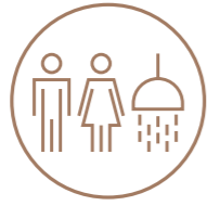
Refurbished W/C's and showers