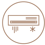
VRF air conditioning