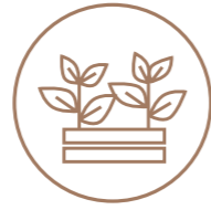
Landscaped communal garden with meeting pod