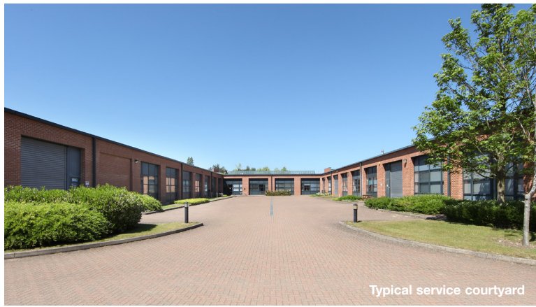
Typical service courtyard