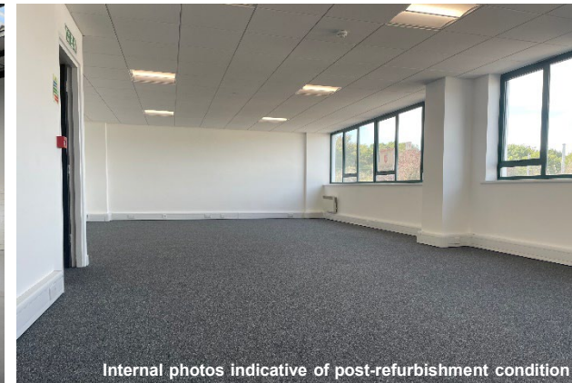
Internal photos indicative of post-refurbishment condition