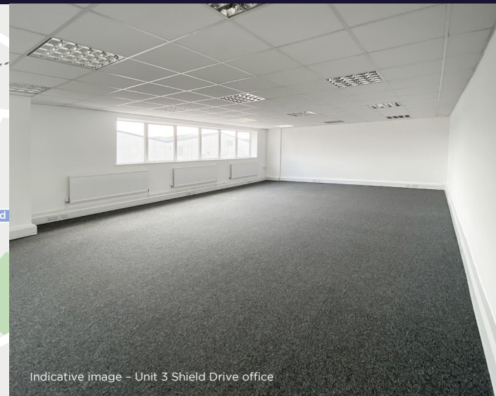
Indicative image - Unit 3 Shield Drive office