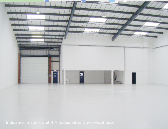
Indicative image - Unit 4 Amalgamated Drive warehouse

EPC To be assessed following refurbishment.