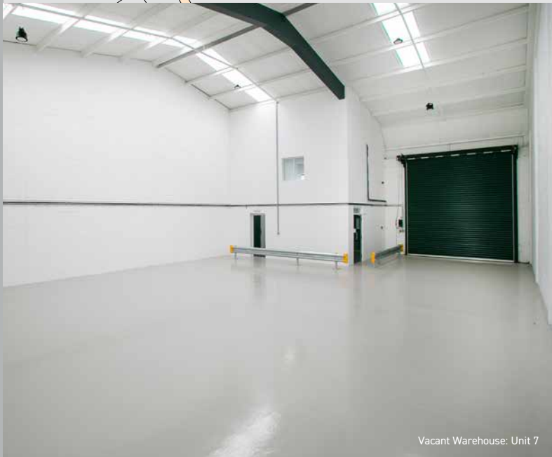
Vacant Warehouse: Unit 7