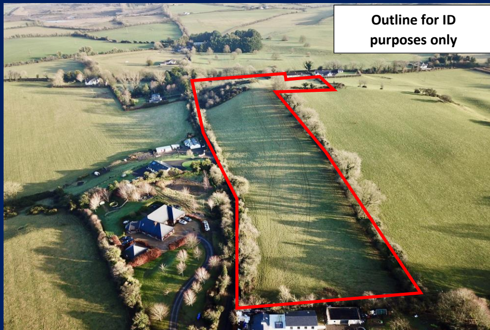
Outline for ID purposes only