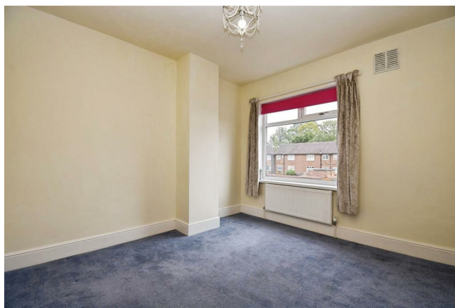
Bedroom two 11'0" x 10'5" (3.36 x 3.20 )

UPVC double glazed window, central heating radiator, and carpeted flooring.