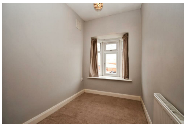
Bedroom three 8'10" x 5'7" (2.71 x 1.72 )

UPVC double glazed window, central heating radiator, and carpeted flooring.