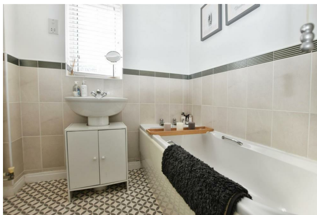
Bathroom 8'8 x 5'7 (2.64m x 1.70m)

Low flush toilet, pedestal sink, panelled bath with half tiled walls and Upvc double glazed window.