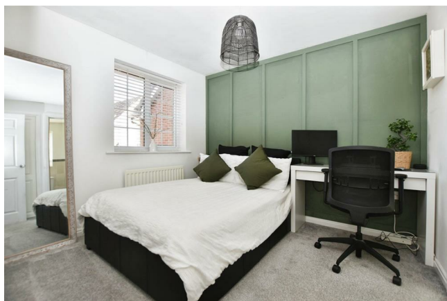
Bedroom Two 9'7 x 8'9 (2.92m x 2.67m)

Upvc double glazed window and central heating radiator. Built in store. En suite.