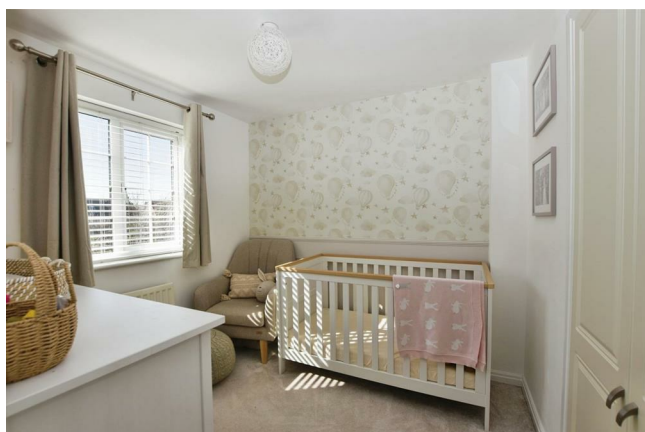
Bedroom Three 10'6 max x 8'6 (3.20m max x 2.59m)

Upvc double glazed window, central heating radiator and built in storage cupboard.