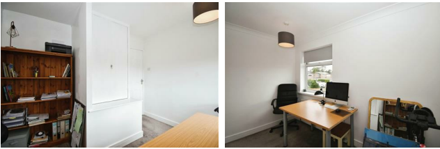
Bedroom three 8'10" x 10'5" (2.70 x 3.19 )

UPVC double glazed window, central heating radiator, built-in storage cupboard, and carpeted flooring.