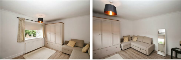
Bedroom two 10'6" x 12'5" (3.21 x 3.79 )

UPVC double glazed window, central heating radiator, and carpeted flooring.