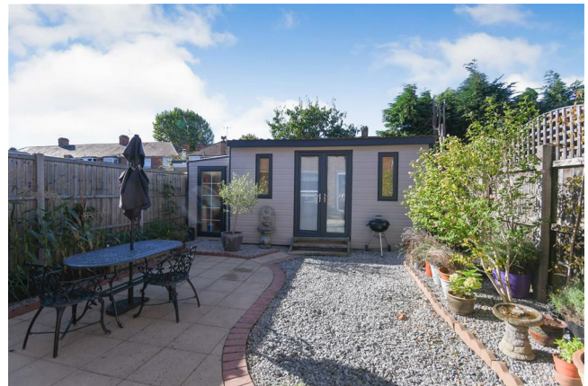
Entertainment room 8'7" x 15'1" (2.64 x 4.61 )

UPVC double glazed French doors, two UPVC double glazed windows, wooden flooring and fitted with a worktop. The building has connection to lighting / power, insulation and additional external storage.