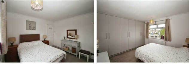
Bedroom one 11'0" x 12'3" (3.37 x 3.74 )

UPVC double glazed window, central heating radiator, fitted wardrobes, and carpeted flooring.