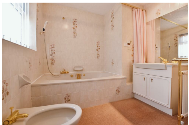
Bathroom 10'2" x 10'2" (3.10m x 3.10m)

Two Upvc double glazed windows, central heating radiator, tiled walls and fitted with a four piece suite comprising of jacuzzi style bath with shower head above, vanity sink, bidet and low flush W.C.