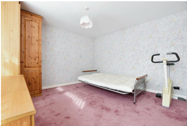
Bedroom Two 12'0" x 11'1" (3.68m x 3.38m)

Upvc double glazed window, central heating radiator, fitted wardrobe.