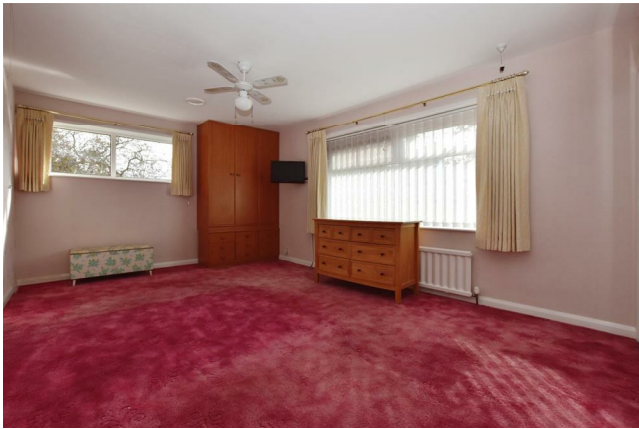
Bedroom One 16'7" x 11'5" (5.08m x 3.48m)

Two Upvc double glazed windows, central heating radiator, fitted sliding wardrobes and further wooden wardrobe. Ceiling fan with light and additional air conditioning in ceiling.