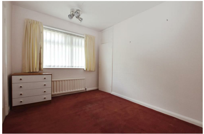
Bedroom Three 14'0" x 7'8" (4.27m x 2.36m)

Upvc double glazed window, central heating radiator and two built in storage cupboards.