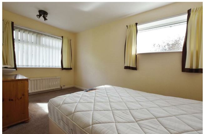
Bedroom Four 9'8" x 8'5" (2.97m x 2.59m )

Two Upvc double glazed windows, central heating radiator, built in storage cupboard and a wall mounted sink.