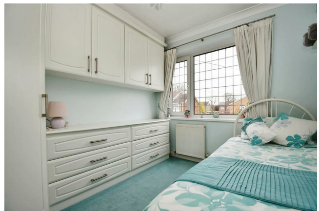
Bedroom Four 10'0" x 8'5" maximum (3.06m x 2.57m maximum )

UPVC double glazed window, central heating radiator, fitted wardrobes and drawers and carpeted flooring.