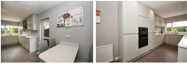
Kitchen 20'11" x 7'10" (6.39m x 2.40m )

UPVC double glazed door, UPVC double glazed window, central heating radiator, tiled flooring and fitted with a range of floor and eyelevel units, quartz worktop with upstand laminate above, sink with mixer tap and fitted with a range of integrated appliances including oven and microwave, hob with extractor hood above, fridge-freezer, dishwasher and washing machine.