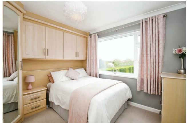
Bedroom Three 10'6" x 10'1" maximum (3.22m x 3.09m maximum )

UPVC double glazed window, central heating radiator, fitted wardrobes and drawers and carpeted flooring.