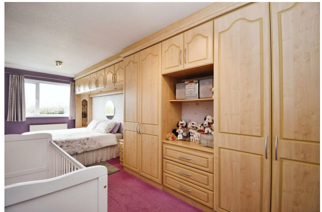
Bedroom Two 8'4" x 14'8" maximum (2.56m x 4.48m maximum )

UPVC double glazed window, central heating radiator, fitted wardrobes and drawers and carpeted flooring.