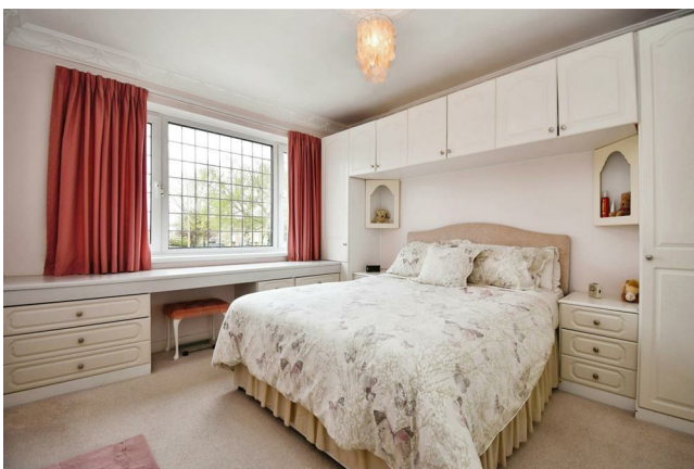
Bedroom One 10'7" x 13'0" maximum (3.24m x 3.98m maximum )

UPVC double glazed window, central heating radiator, fitted wardrobes and drawers and carpeted flooring.