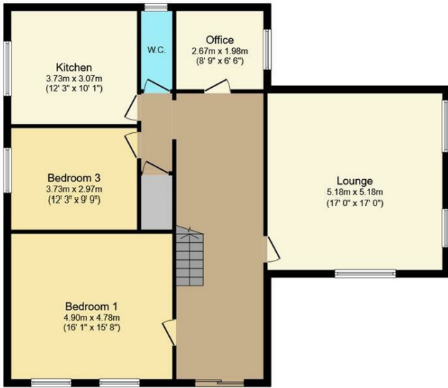
First Floor Floor area 108.2 sq.m. (1,165 sq.ft.) approx