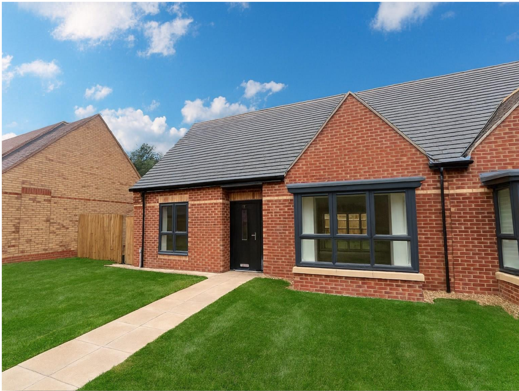
4, The Cypress, Valley Lane, Mansfield, NG18 2HT