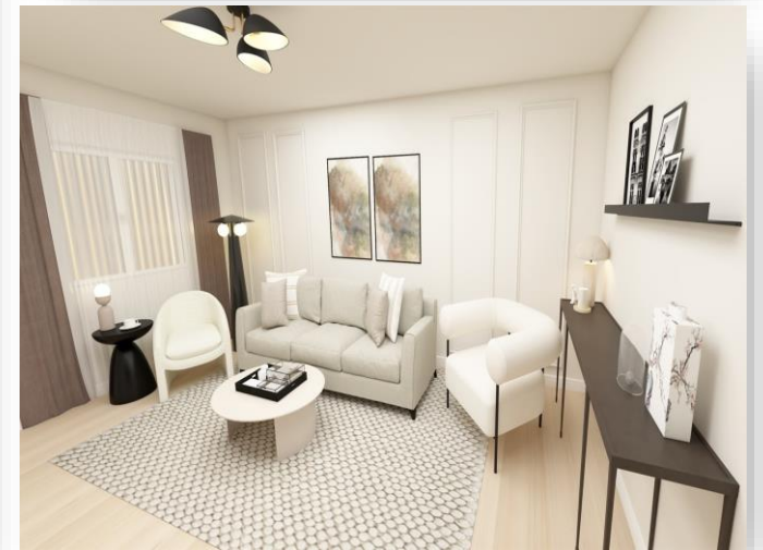
The Malting, The Old Mill Farndon Road, Newark NG24 4SP