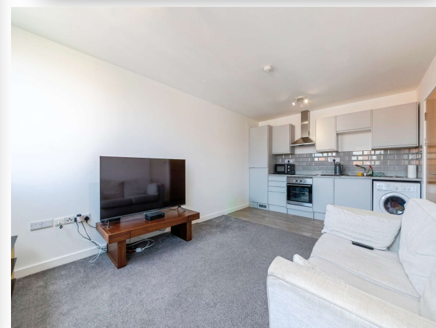
Lombard House Lombard Street, Newark NG24 1XG