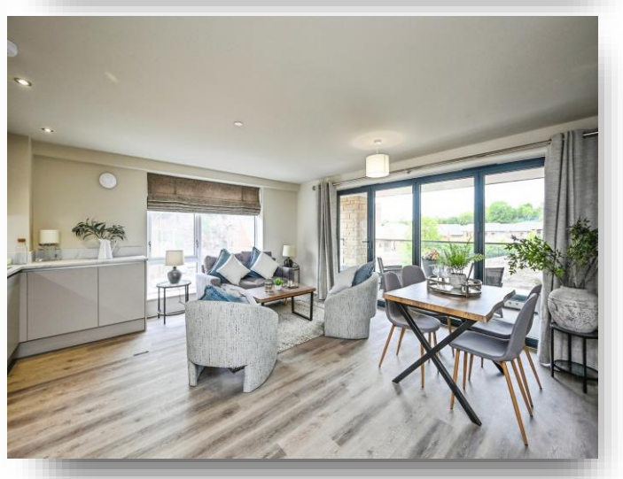
Apt 14, 1A, Mustard Mills, Valley Lane, Mansfield NG18 2HT