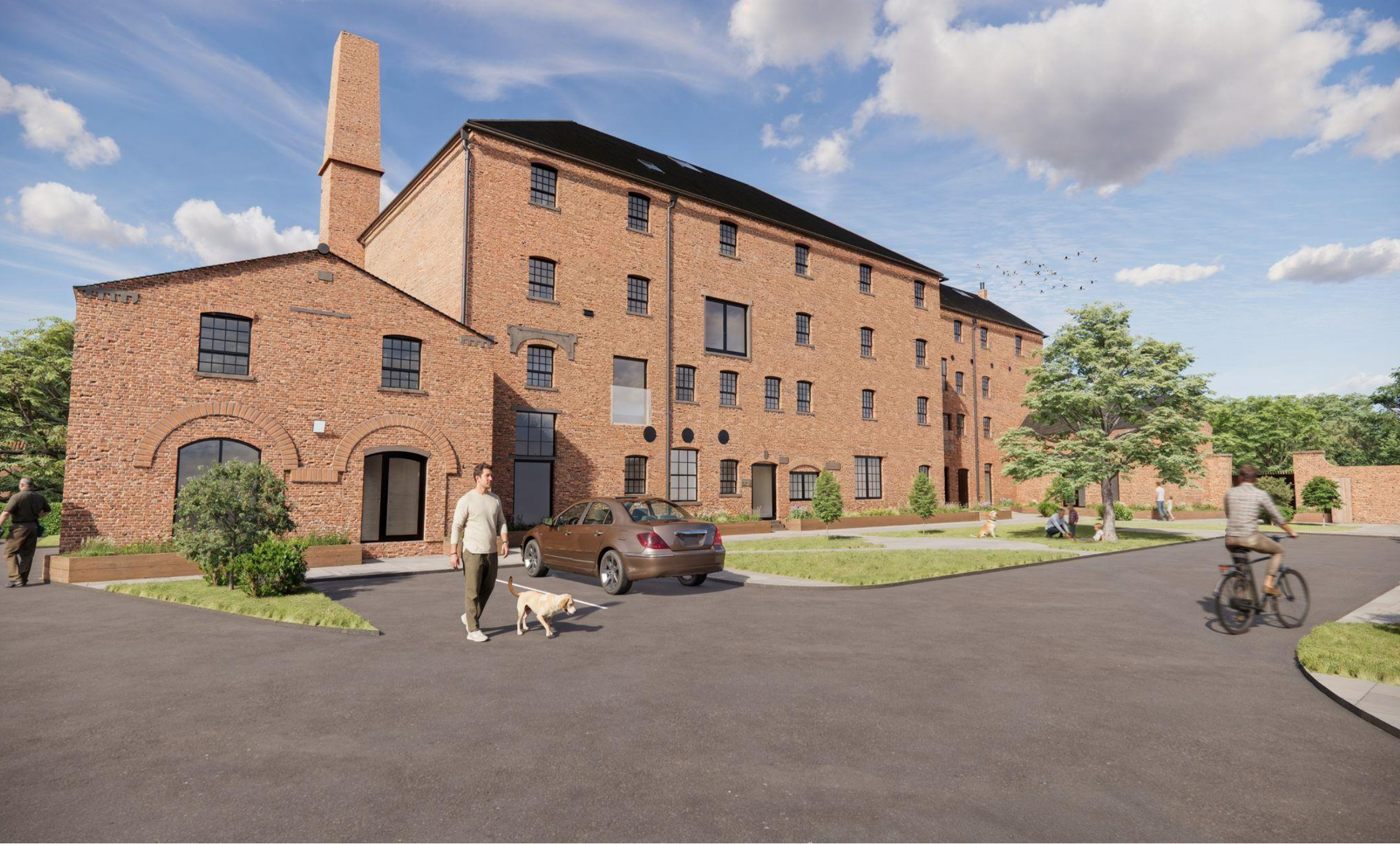
The Old Mill, Farndon Road, Newark, NG24 4SP