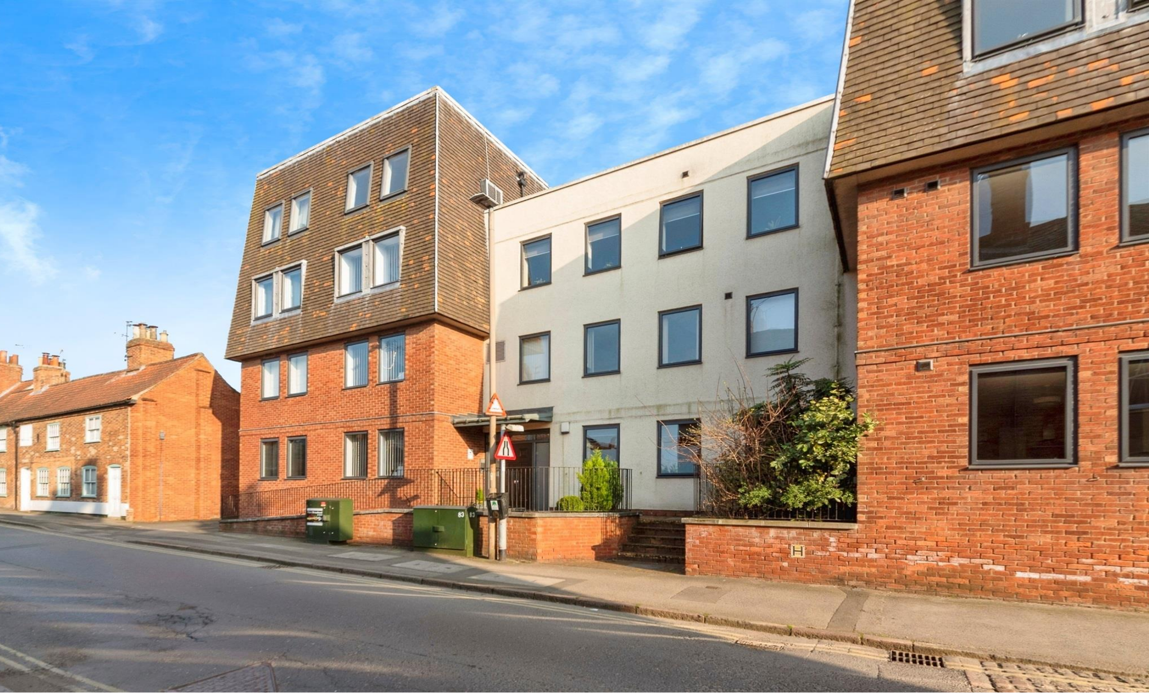
Apartment 12, Mill Gate Apartments, Mill Gate, Newark, NG24 4TR