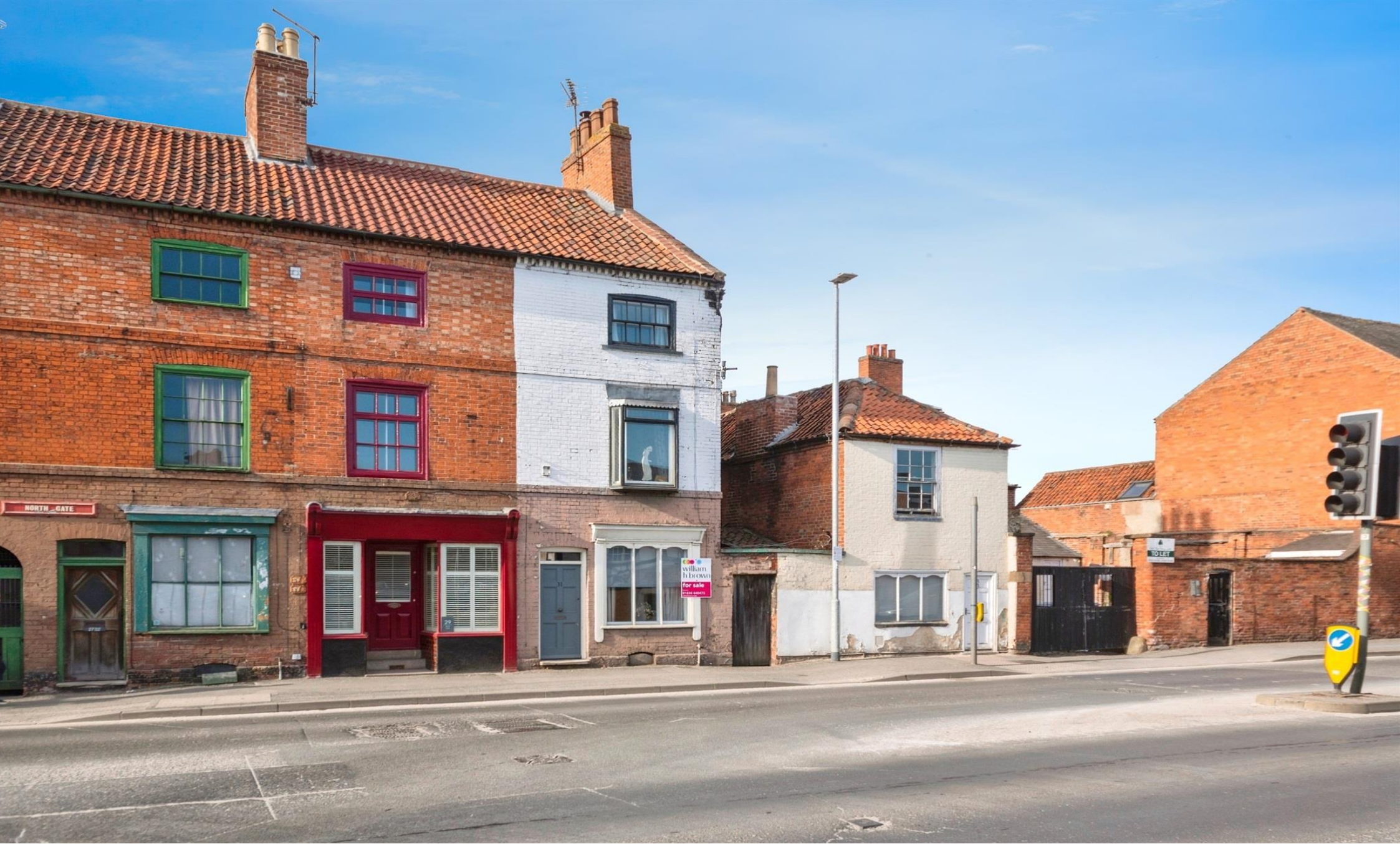
North Gate, Newark, NG24 1HD