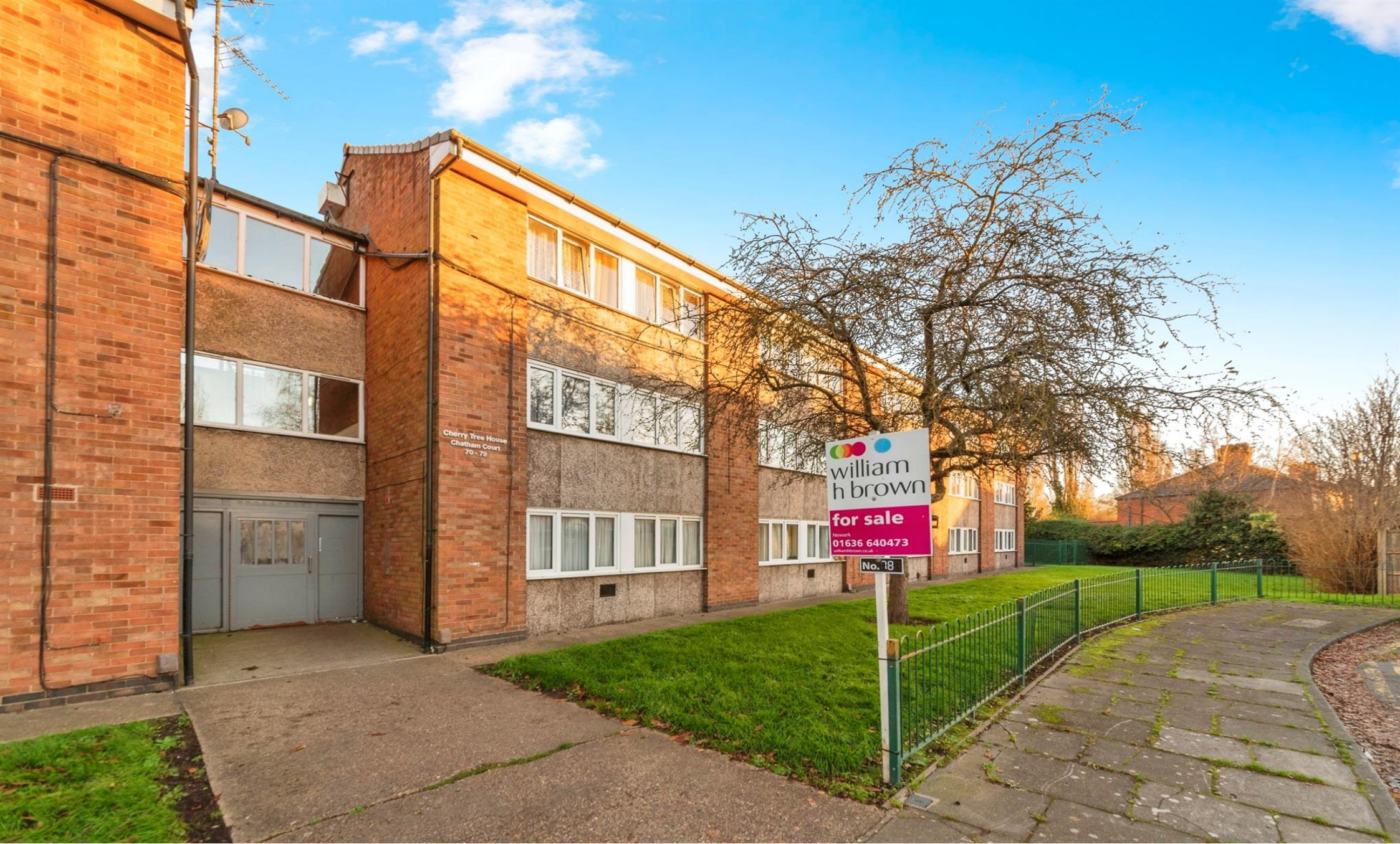
Chatham Court, Newark, NG24 4BH