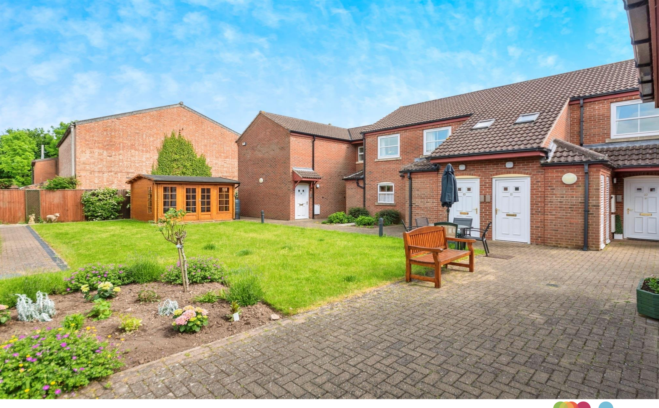
Warwick Court, Balderton, Newark, NG24 3SU