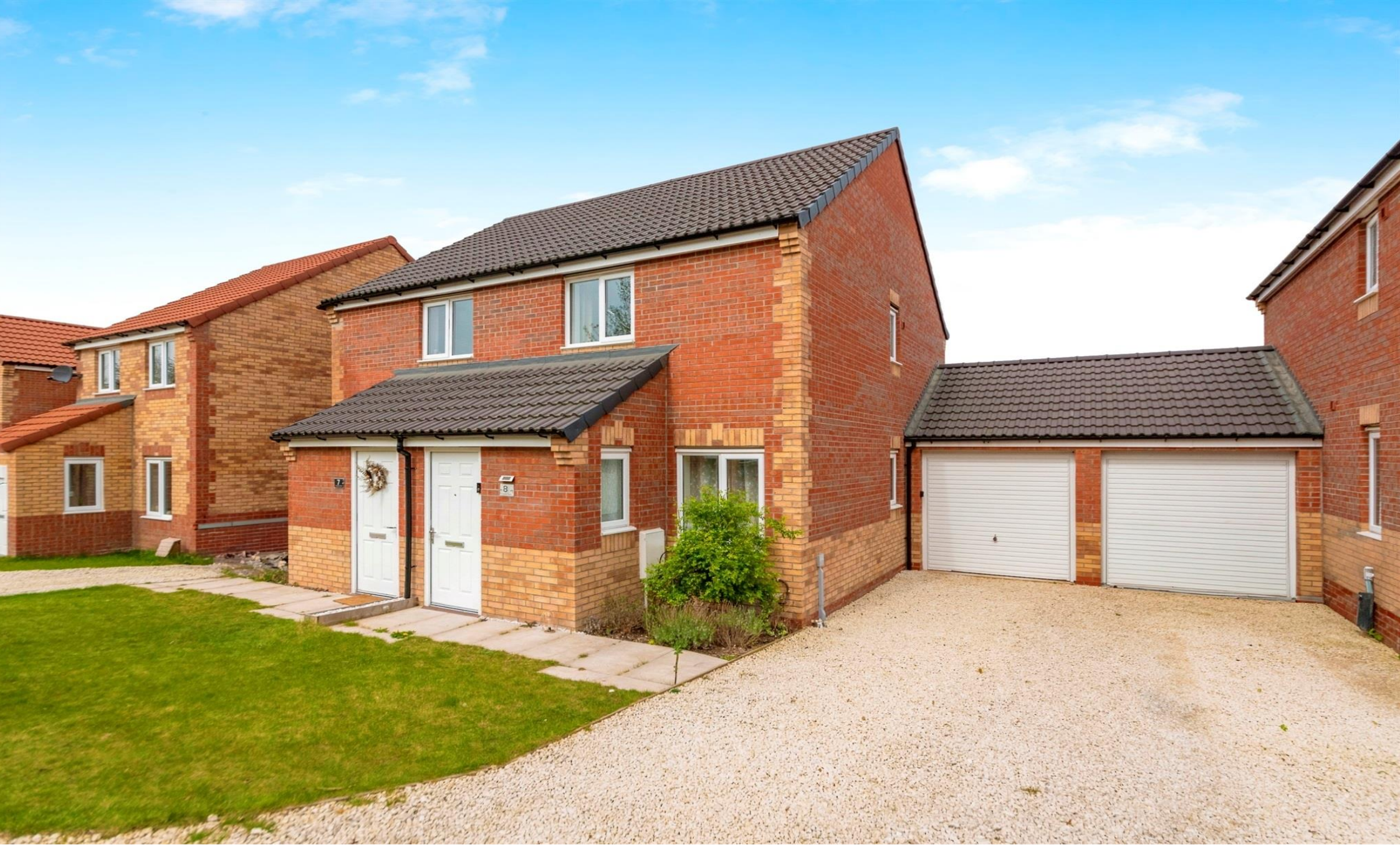
Parkgate Close, New Ollerton Newark NG22 9XP