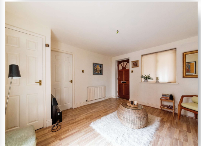
Stodman Mews, Newark NG24 1DE