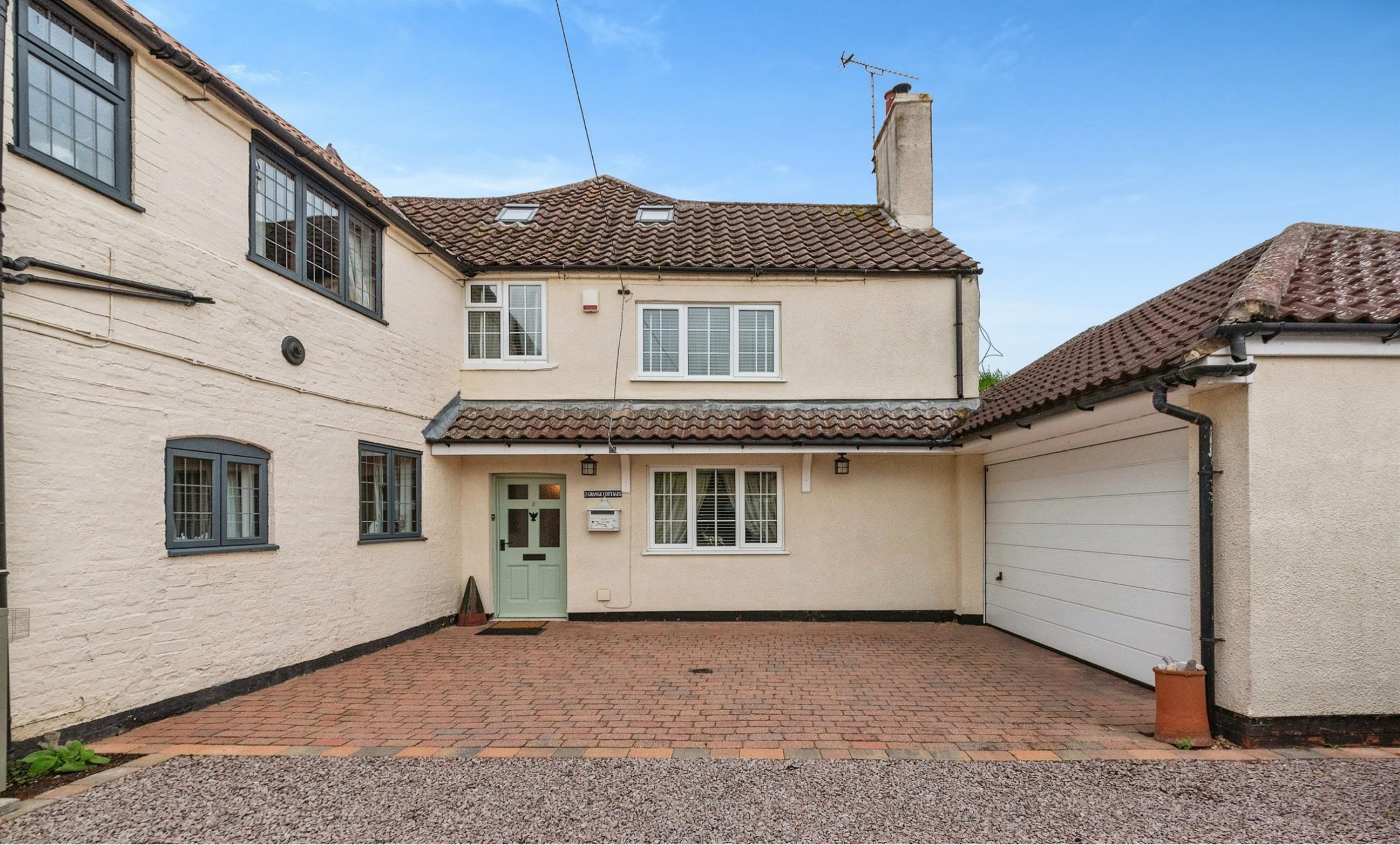
Grange Cottages Bathley Lane, Little Carlton Newark NG23 6BY