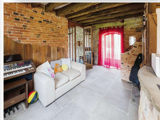
The Dovecote House Bakers Lane, Westborough NEWARK NG23 5HL