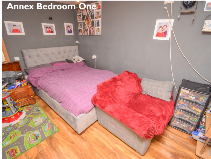
Annex Bedroom One

The picturesque village of Knockfarrel is sought after being semi-rural yet being within approximately four miles of the town of Dingwall. Dingwall has a train station and where local amenities include high street shops, supermarkets, primary and secondary schooling (school busses running through Knockfarrel), a leisure centre, and two medical practices. The city of Inverness that boasts a wider range of shops and services is within easy commuting distance some 14 miles distant from Dingwall.