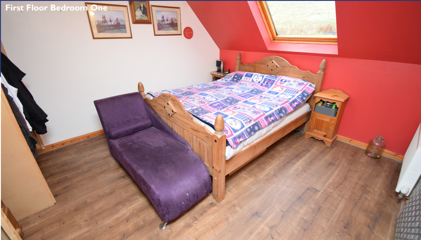
First Floor Bedroom One