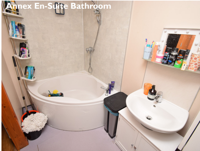
Annex En-Suite Bathroom