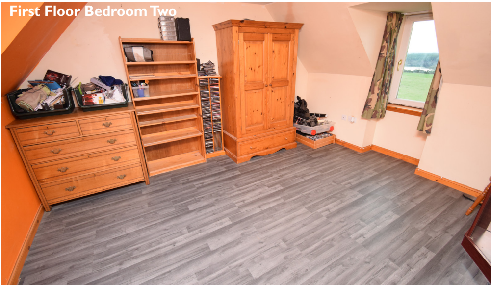
First Floor Bedroom Two