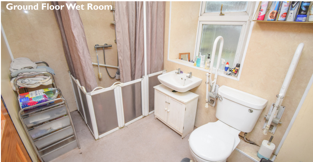
Ground Floor Wet Room