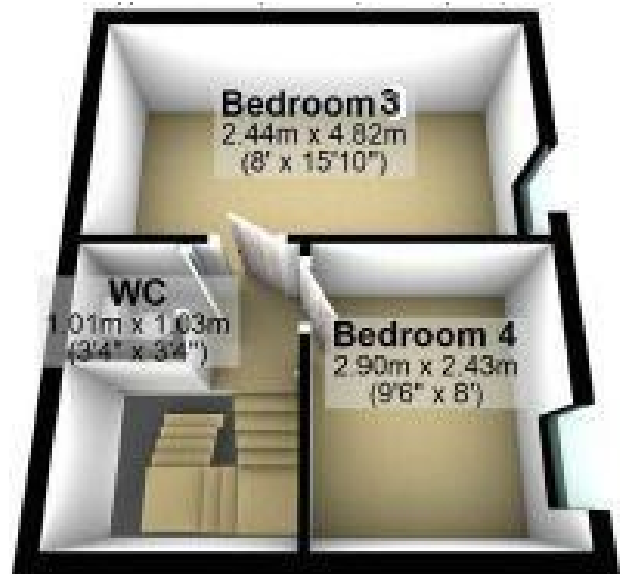
Second Floor (Approximate) 293.8 ft 2 (27.3 m 2 )

These particulars, whilst believed to be accurate are set out as a general outline only for guidance and do not constitute any part of an offer or contract. Intending purchasers should not rely on them as statements of representation of fact, but must satisfy themselves by inspection or otherwise as to their accuracy. No person in this firm's employment has the authority to make or give any representation or warranty in respect of the property.