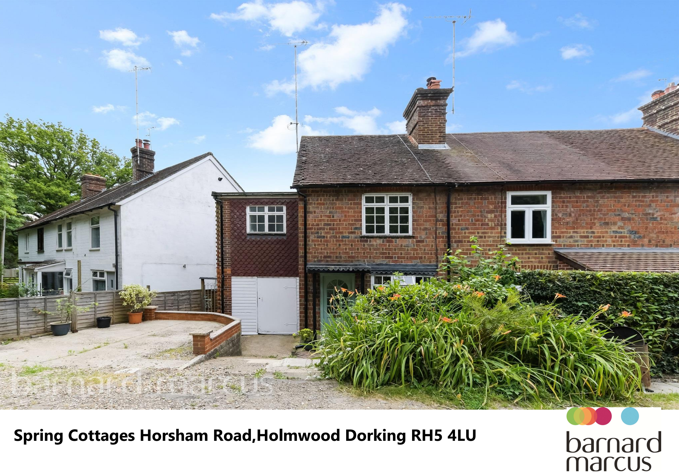
Spring Cottages Horsham Road, Holmwood Dorking RH5 4LU