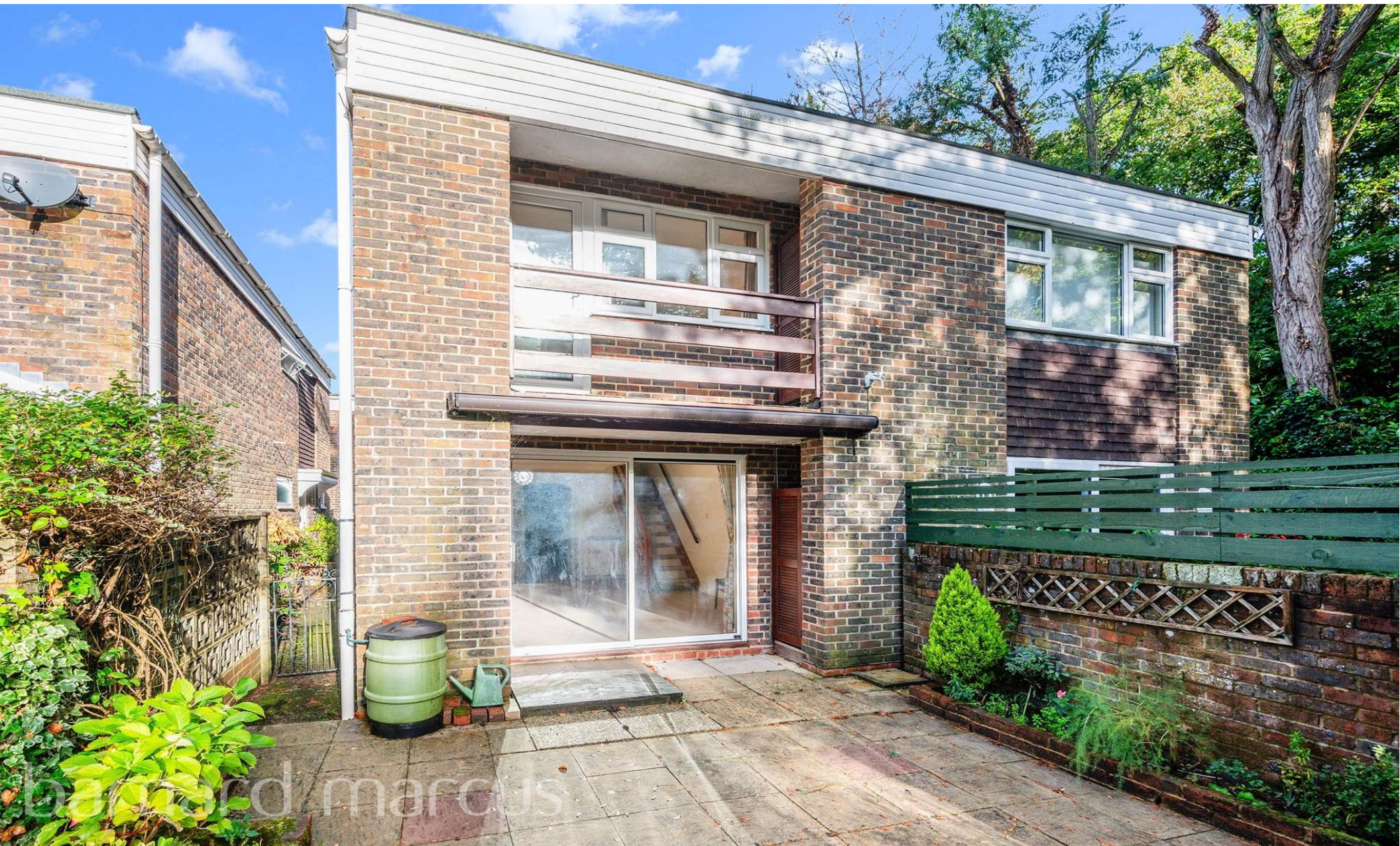
Broomhurst Court Ridgeway Road, DORKING RH4 3EH