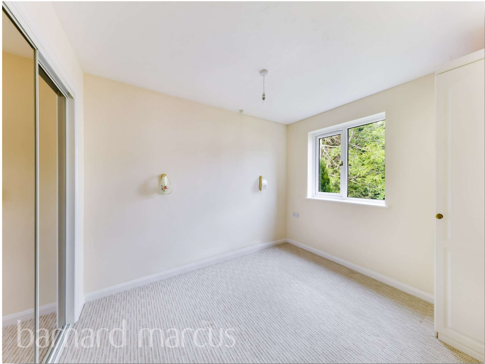
Bartholomew Court South Street, Dorking RH4 2EN