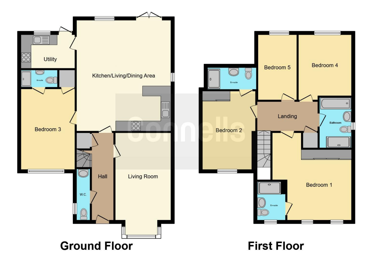
This floor plan is for illustrative purposes only. It is not drawn to scale. Any measurements, floor areas (including any total floor area), openings and orientation are approximate. No details are guaranteed, they cannot be relied upon for any purpose and they do not form part of any agreement. No liability is taken for any error, omission or misstatement. A party must rely upon its own inspection(s). Powered by www.focalagent.com

To view this property please contact Connells on