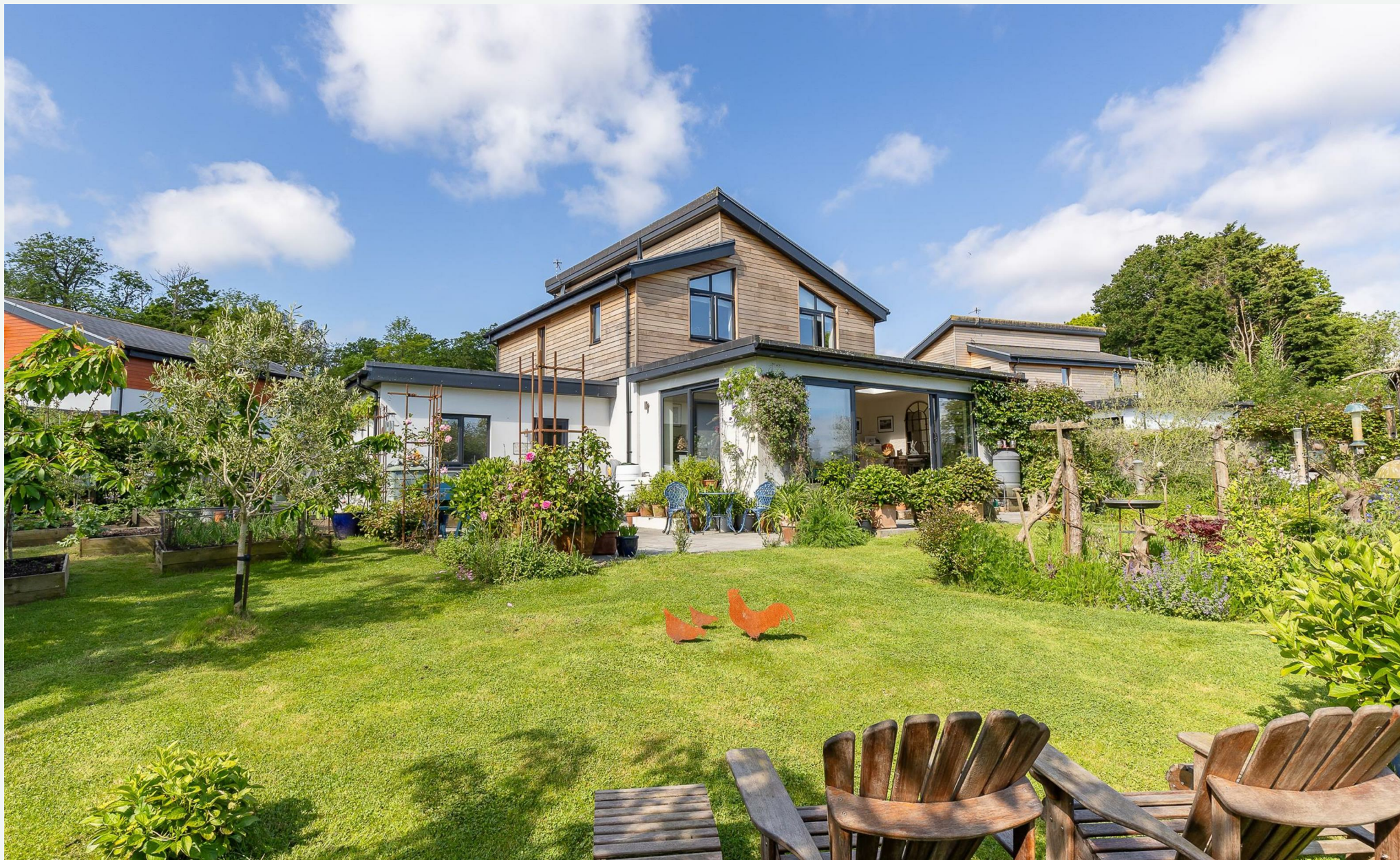
The Slip Garden Swaylands Close, Ryde, Isle of Wight, PO33 1FA