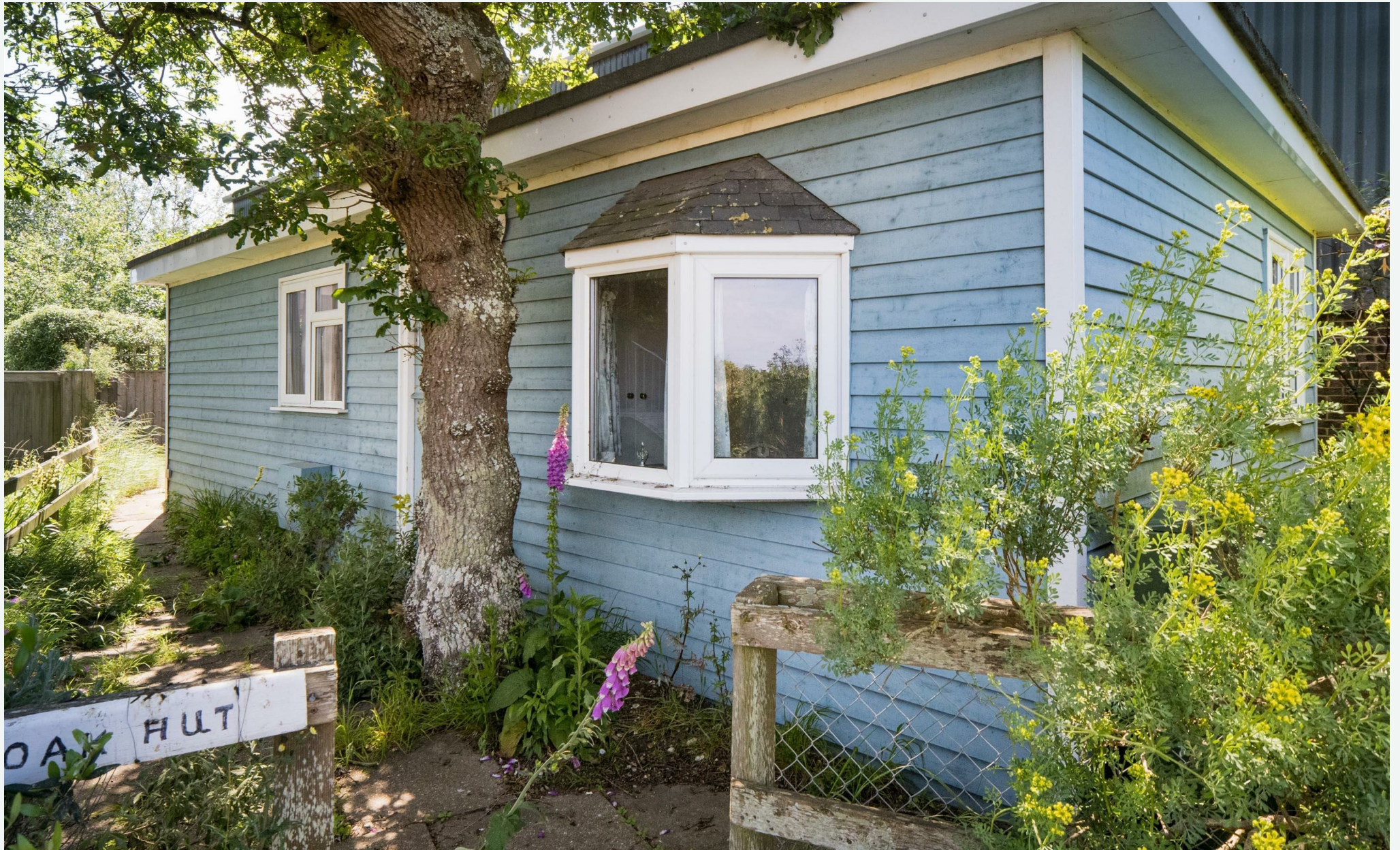
Oak Hut The Duver, St. Helens, Isle of Wight, PO33 1YB