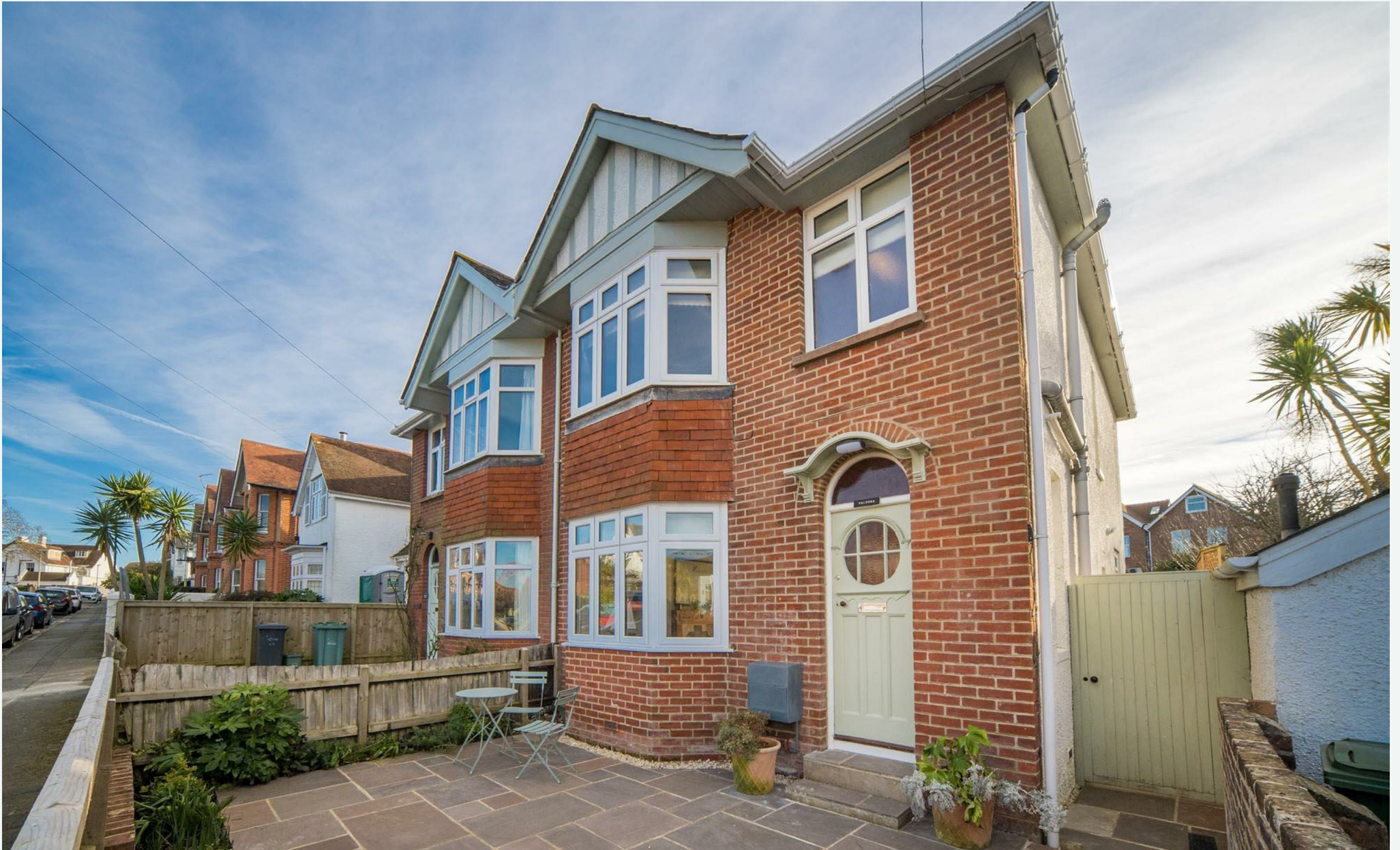
Valdora Fairy Road, Seaview, Isle of Wight, PO34 5HF