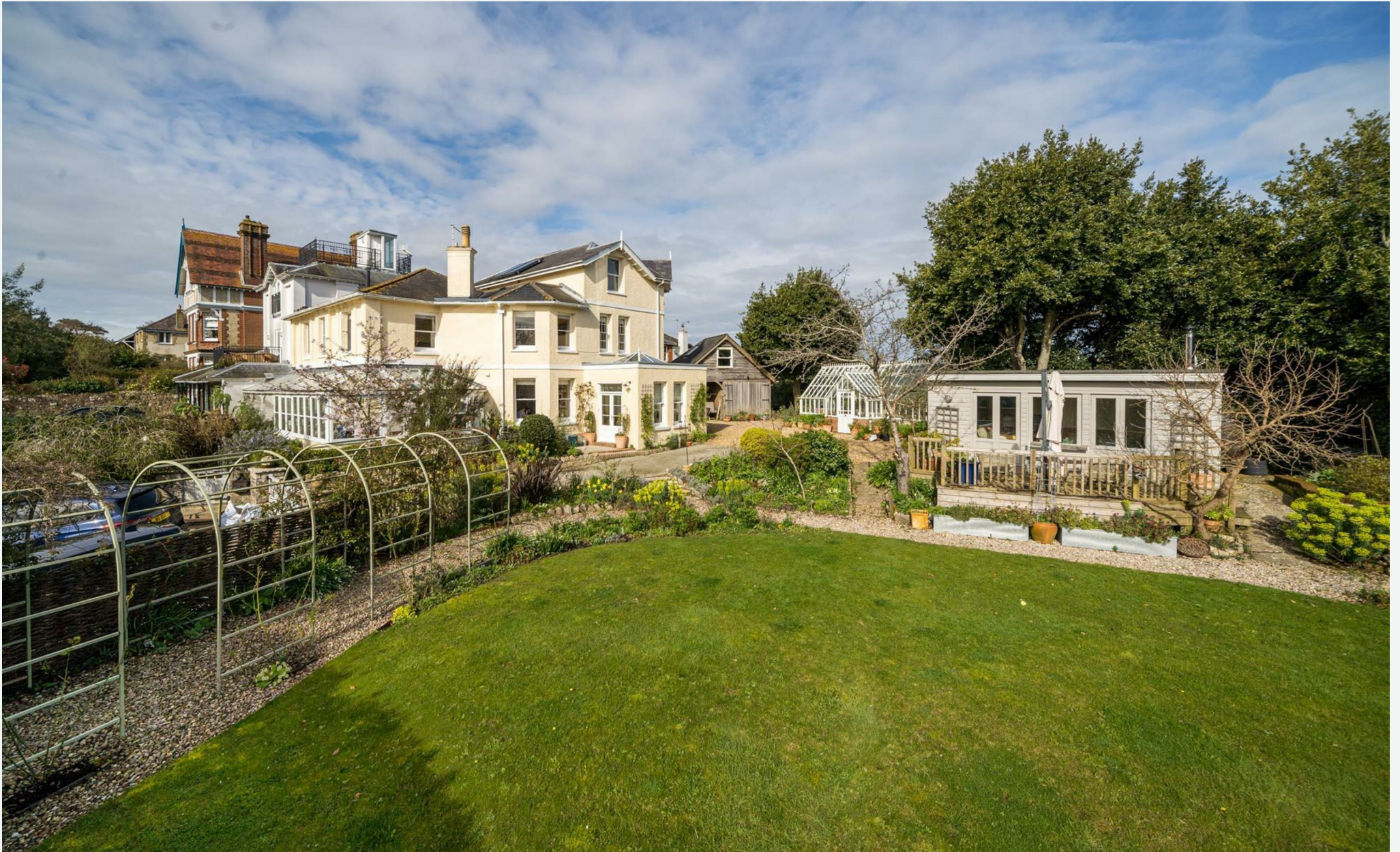
Beach House Duver Road, St Helens, Isle of Wight, PO33 1XY