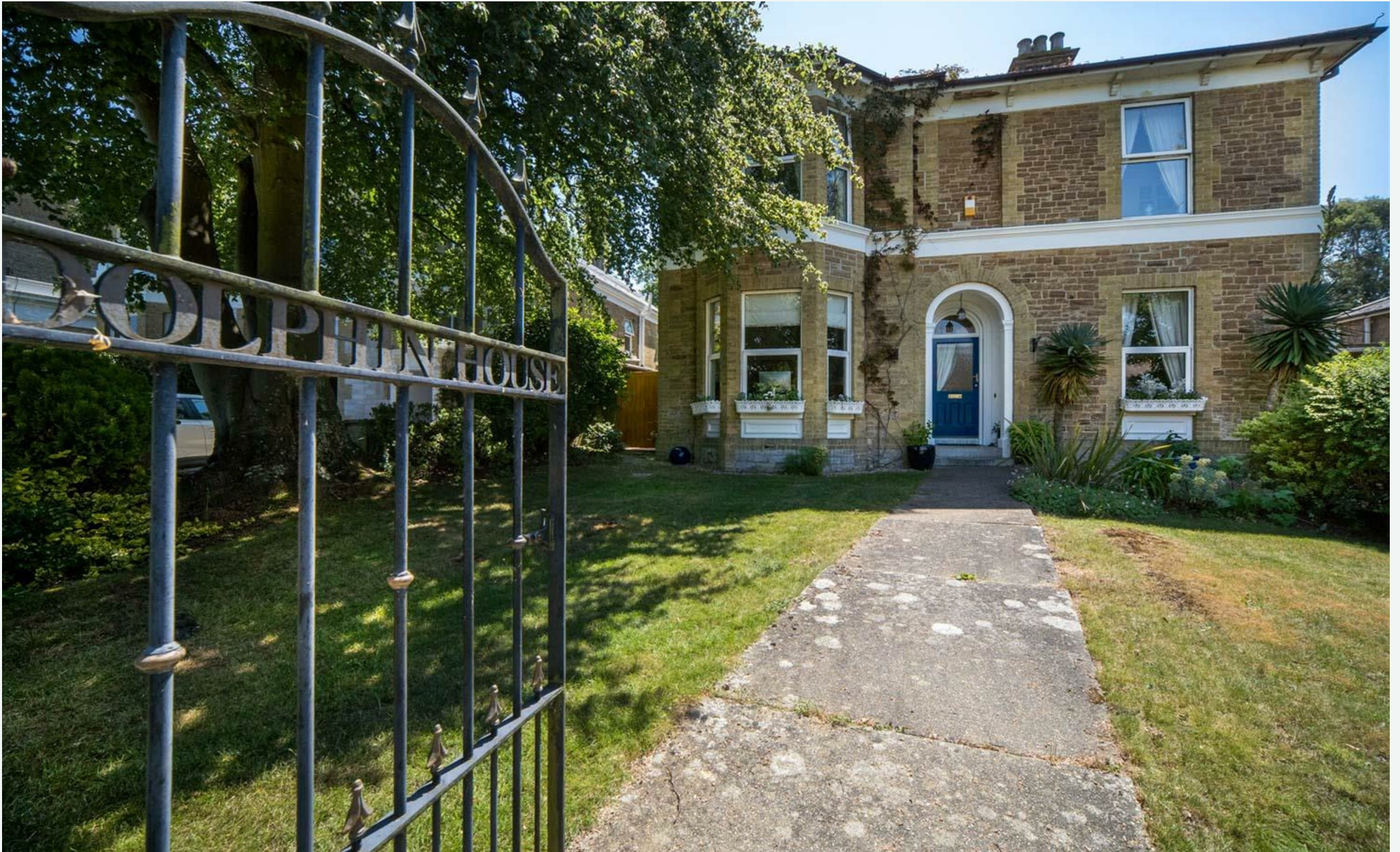
Dolphin House, 16 Queens Road, Ryde, Isle of Wight, PO33 3BG